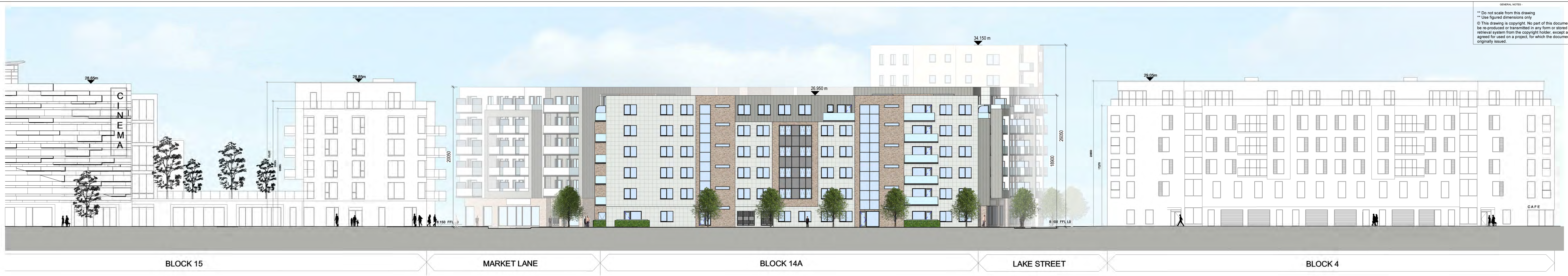
BLOCK 14 NORTH ELEVATION TO MARKET STREET Scale 1 : 200

GENERAL NOTES: ** Do not scale from this drawing ** Use figured dimensions only © This drawing is copyright. No part of this document may be reproduced or transmitted in any form or stored in any retrieval system from the copyright holder, except as agreed for use on a project, for which the document was originally issued.