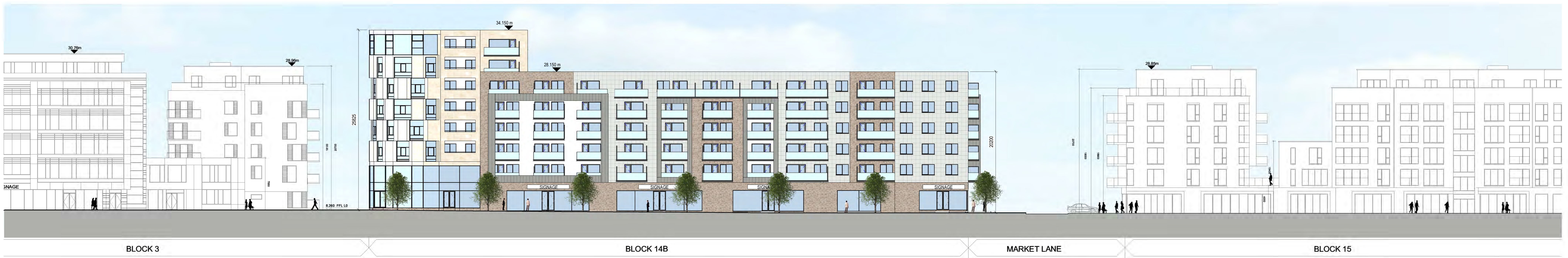
BLOCK 14 SOUTH ELEVATION TO MAIN STREET Scale 1 : 200