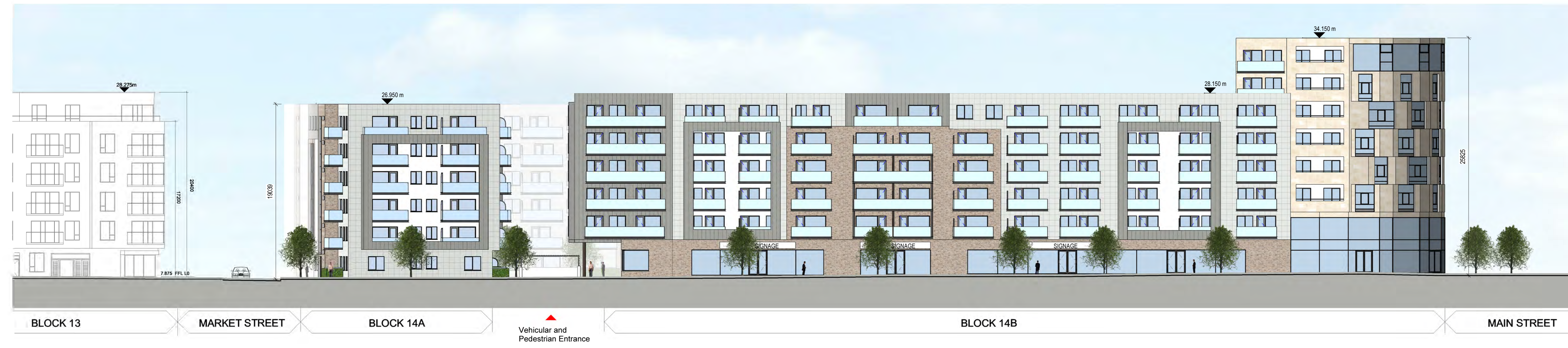
BLOCK 14 WEST ELEVATION TO LAKE STREET Scale 1 : 200